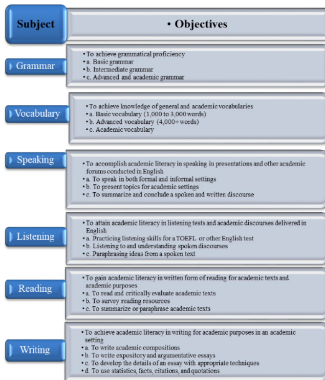
Diagram 4: Revised subject matters and objectives of program

starting point for students becoming involved in the EAP program. In addition, academic literacy refers to the competency that students must attain for academic communication in English. Students and teachers indicated that for their needs, academic literacy should start with academic writing, academic speaking, and academic reading. Academic listening was considered a skill that would come later, so they did not include it as a top priority.